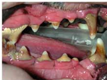
Before Dental Treatment

Tartar is a mixture of minerals and salts, food particles and plaque that combine together to form a solid, firmly attached yellowish layer on the surface of the teeth. Tartar traps more food particles between itself and the gums. The food particles start to rot causing gingivitis (inflammation of the gums). As a result, the gums bleed very easily and cause a lot of pain when eating. Eventually, the inflamed gums move away from the decaying area, exposing the tooth roots. Once the tooth roots and bone sockets are exposed, bacteria from the rotting food destroy the bone holding the teeth in place (a very painful experience in humans).