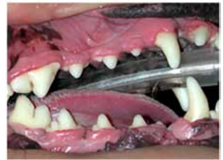
After Dental Treatment

We recommend 6 monthly Dental checkups for all pets - just like humans